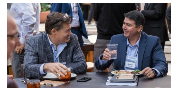
Photographs from 2022 and 2023 EFCG Conferences